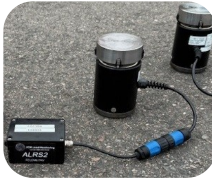
100 Tonne wireless compression