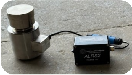
50 Tonne wireless compression

The compression wireless setup allows for multiple different style of compression load cells to be connected to an ALRS2 telemetry enclosure, with the short cable length allowing the user to mount the ALRS2 telemetry enclosure in a position where the structure that is being weighed is not impacting the signal.