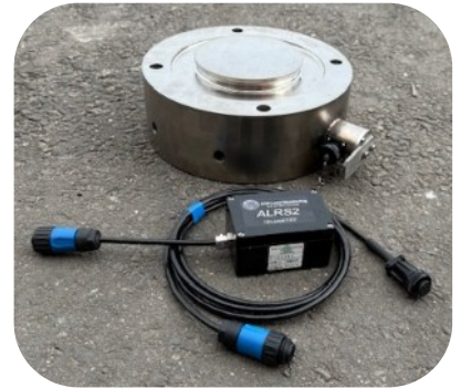
600 Tonne wireless compression